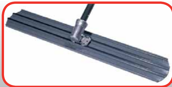
Easy Bull Float