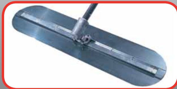
Big Blue Float